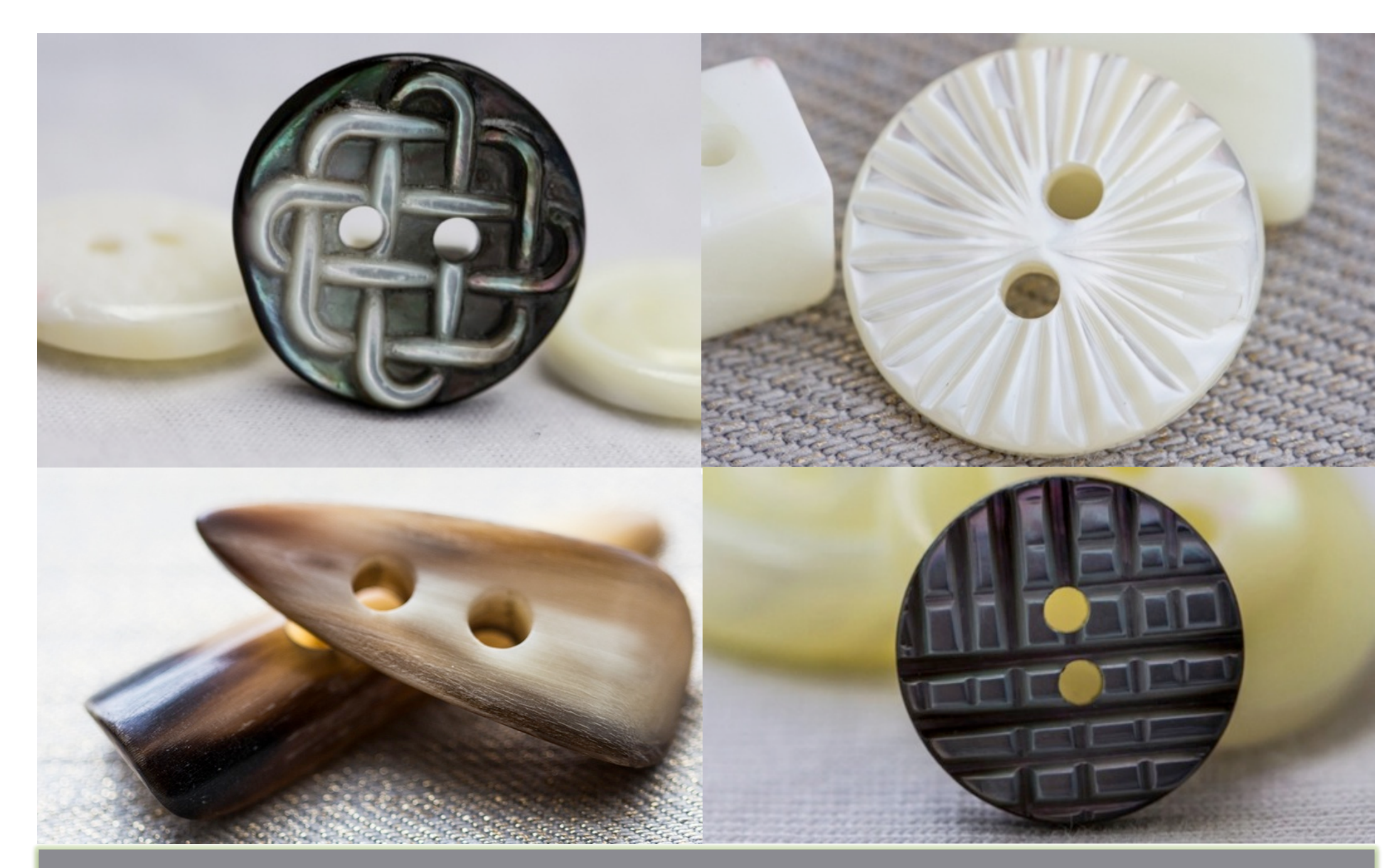
NATURAL MATERIALS: Real Shell, Horn, Wood, Coconut, Corozo A complete process from raw materials to the finished products